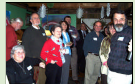
It was standing room only at the Inn for our January After Hours.